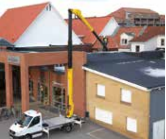
The ability to work over rooftops to access difficult to reach areas is aided by a flat bottomed basket