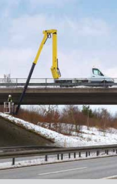
Ability to access below ground