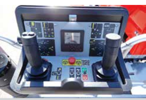
Easy to use full proportional (FPC) CANbus controls with display